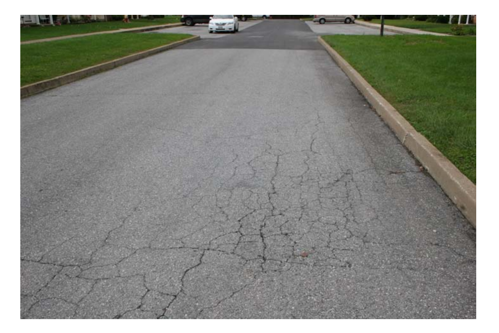
PHOTO #3 Further down the same street, new deflection is now present where none existed four years ago.