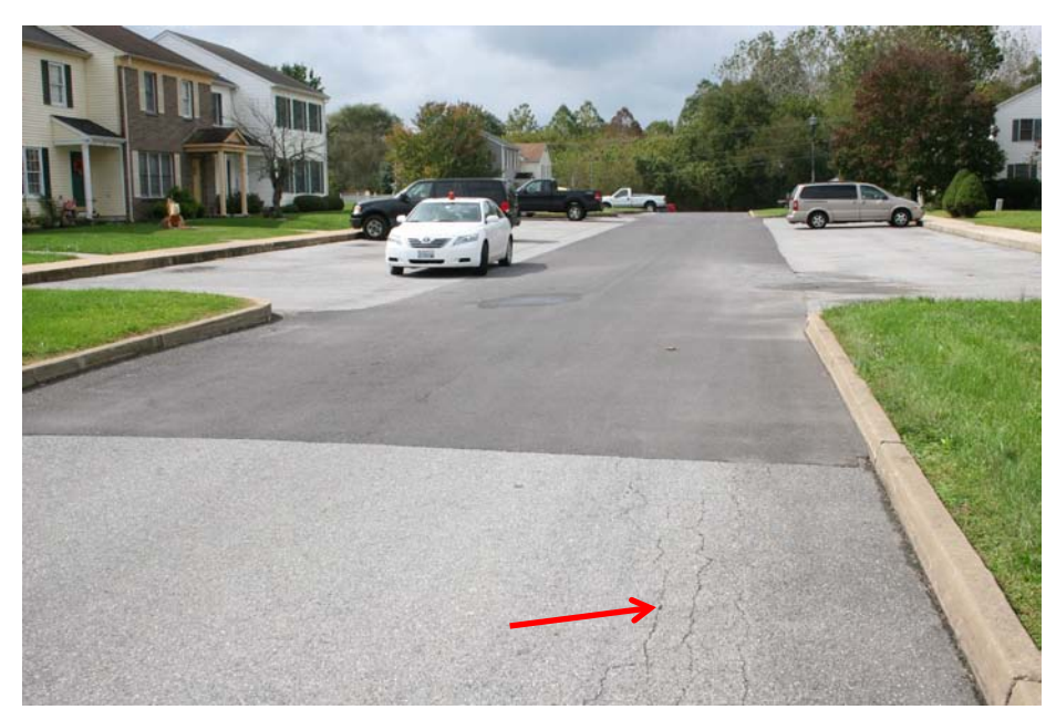
PHOTO #2 In the same area this shows the extent of the additional deflection beyond the overlay.

Here is an example, where, in proximity of recent overlay repair, there is additional damage now extending beyond the original overlay, as deflection continues.