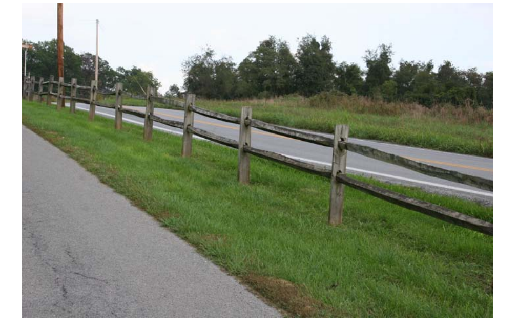
PHOTO #14 Split-rail fencing has benefitted from supplements from other fencing that was removed and replaced by vinyl fencing.