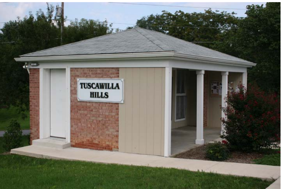
PHOTO #10 This is impact damage of sidewalk panels near the Central Mail Station. This type of deficiency could be a potential tripping hazard.