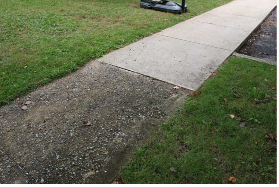
PHOTO #9 This is an example of severe surface scaling of a sidewalk panel requiring replacement.

This is an example of differential settlement of adjacent sidewalk panels resulting in a tripping hazard requiring repair.