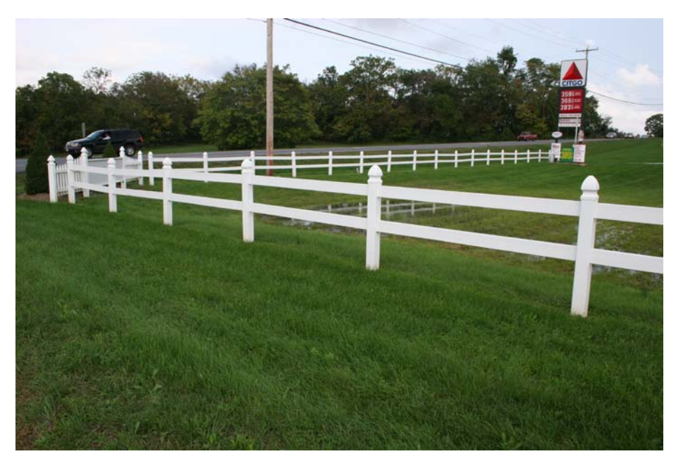
PHOTO #15 This the new replacement vinyl fencing that has been installed at the entrance and at Fenway Drive.

PHOTO #14 Split-rail fencing has benefitted from supplements from other fencing that was removed and replaced by vinyl fencing.