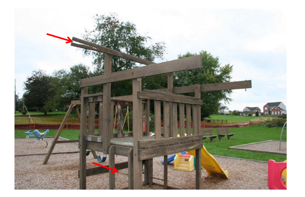
PHOTO #13 The wood play module is at the end of its service life and should be replaced for safety.